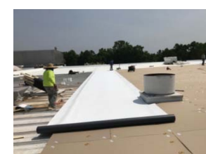
Building 1 Roof insulation