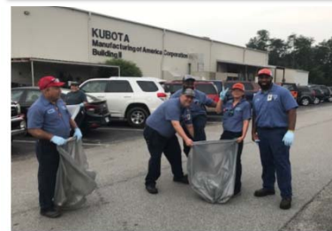
Environmental Month Clean-up