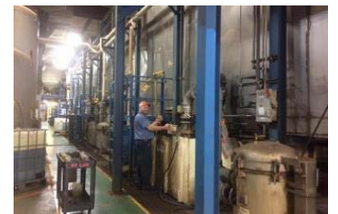
Building #2 Washer/rinses