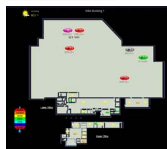
Building Management System