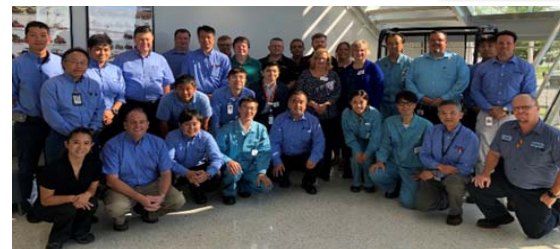
North American Safety & Environmental Conference