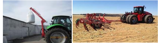
BIG BAG LIFTER EXLIFT