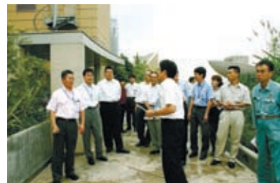
Tour of a company with an advanced environmental policy

If we are to promote environmentally-friendly corporate activities, we have to increase environmental awareness among all of our KUBOTA Group members. The first step in addressing environmental problems is to become aware of the problems. At KUBOTA, we implement regular position-specific educational programs so that our employees can learn about environmental problems. Systematic and specialized education is also being carried out in order to make a satisfactory response to environmental issues. We are aiming at improving our abilities and at an increase in qualified personnel. All of this is tied to the assured practice of environmental conservation. In addition, we participate in environmental education programs offered by external groups and, during June of each year which is Environmental Month, we organize tours of companies with advanced environmental policies. We will continue our efforts to enhance our environmental education qualitatively and quantitatively into FY2010.