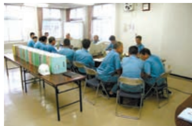
An audit being conducted in a production site