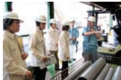
Sakai Plant, Kubota-C.I.