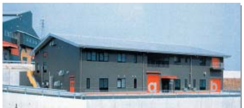
Advanced wastewater treatment facilities