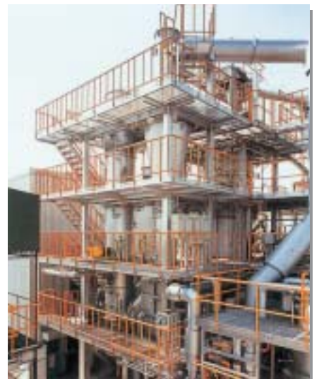
Test plant of circulating-fluidized-bed furnace

We received an order of the equipment of 60 tons per day in capacity, for the Purification Center in the central part in the city of Hamamatsu, our first commercial equipment. We are now constructing the equipment which will be completed in fiscal 2005.