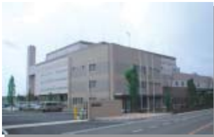
Waste Treatment Center (Gasification & Melting Facility)

Moreover, since fly ash from melting treatment process includes a lot of valuable metals such as zinc, the material recycling can be obtained by resource recovery (smelting process).