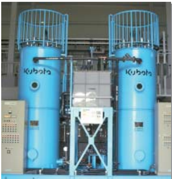
Dioxins decomposition-and-removal equipment