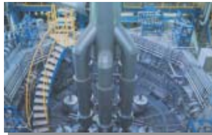
The rotating surface melting furnace