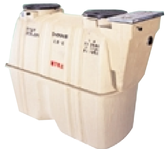
Jookaso KM type

Director and General Manager of Housing Materials and Utilities Consolidated Division