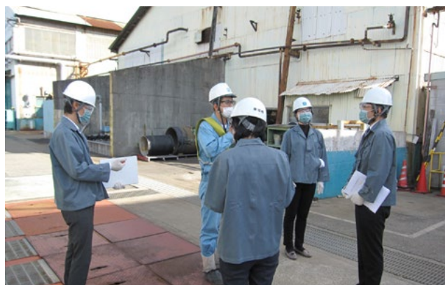
Kubota Hanshin Plant Mukogawa Site