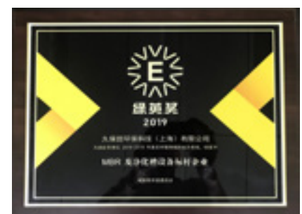
Green Award plaque

The Green Award is presented to companies that are outstanding leaders in the environmental field. This is the fourth year that KEES has received the award. This time the company received the award as a model company in MBR (membrane separation activation sludge method) and purification tank facilities. KEES has been lauded for the excellence of its products and services, and has previously received the prize as a “model manufacturer of membranes for use in wastewater treatment,” a “leading firm in China in the wastewater treatment facility sector,” and a “model company for water treatment facilities and comprehensive services.”