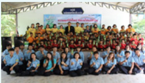
A group photograph with the elementary school students

KET will continue to run education activities at the elementary school, aiming to communicate with the local community while contributing to local environmental conservation activities.