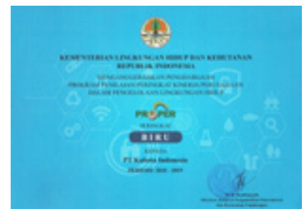
Certificate of Commendation for the BLUE PROPER Award

The BLUE PROPER award is given to companies that comply with 100% of the environmental regulations and properly operate the environmental management system. PTKI will make continuous efforts to enhance environmental management.