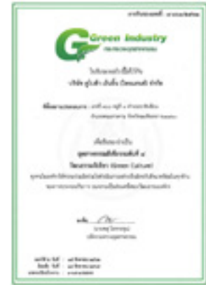
Green Industry Award certificate

The award has a three-year certification period, and SIAM KUBOTA Corporation Co., Ltd. (Amata Nakorn Plant) has previously received a Level 4 award, while SIAM KUBOTA Metal Technology Co., Ltd. and KUBOTA Precision Machinery (Thailand) Co., Ltd. have received Level 3 awards. They are still currently recognized as Green Industries.